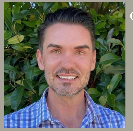
CLICK HERE TO BOOK IN WITH JAMES